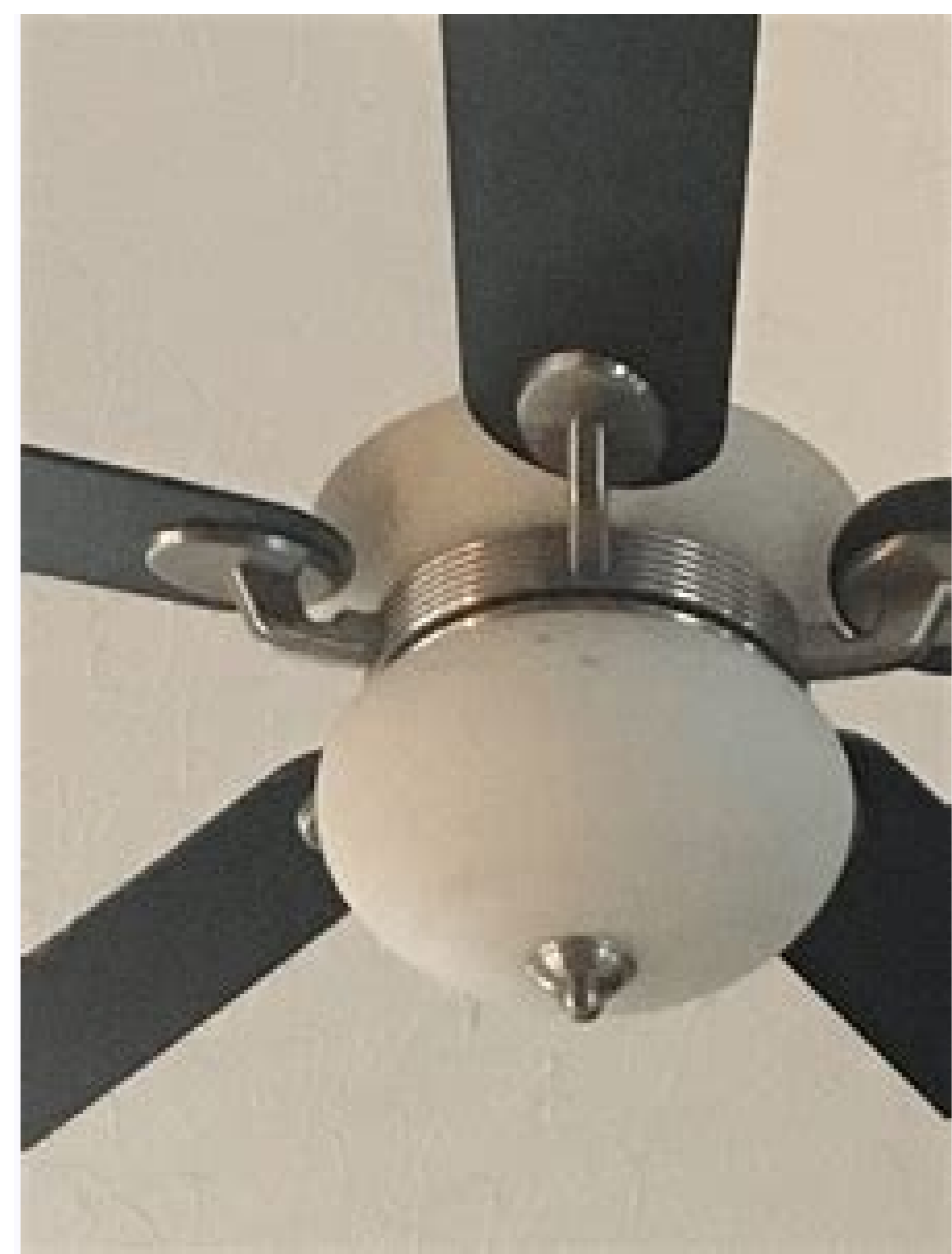
Are hampton bay fans any good. Hampton bay ceiling fan uc7078t user manual.